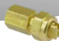
Flat jet nozzle TP 8002 Ms Art.No. 11612810