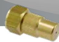
Adjustable nozzles 1.3 mm and 1.7 mm Art.No. 28502598-SB, Art.No. 28502597-SB