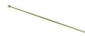
Extension tube 1 m Art.No. 10960601