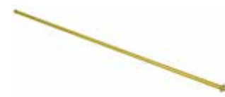
Telescopic tubes 1-2 m Art.No. 10985201