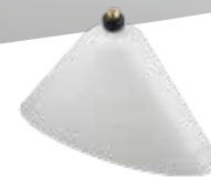
Spray hood oval, white Art.No. 10501606