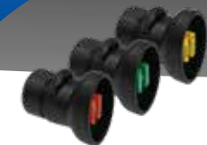
Fanjet nozzles (XR 8001 VS – XR 8008 VS) Art.No. 11612801-SB – 11612808-SB

Well-proven brass trigger valve with a new locking and blocking function.