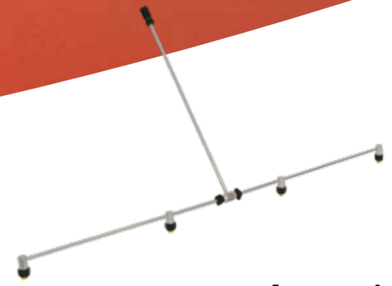
Spray boom aluminium Art.No. 11889501-SB