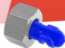
Herbicide floodjet nozzle Art.No. 10501803-SB