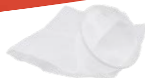
Biofilter Art.No. 11475701