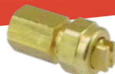
Fanjet nozzle Art.No. 11612810