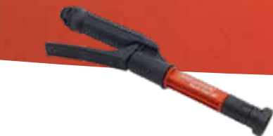
Vario Gun Art.No. 11558501