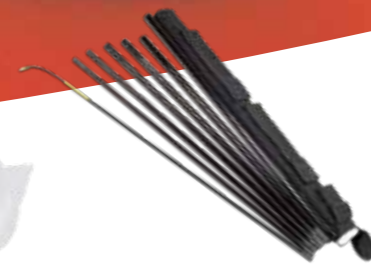
XL 8 S Telescopic extension (7 m) Art.No. 11935801