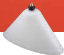
Spray hood oval Art.No. 10501606