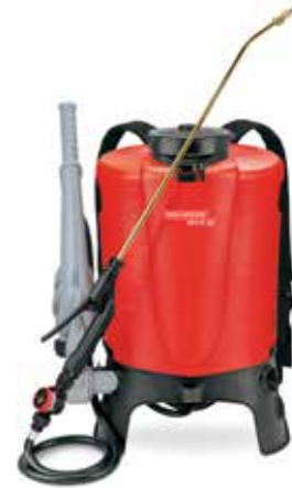
RPD 15 AD1 Art.No. 12117301