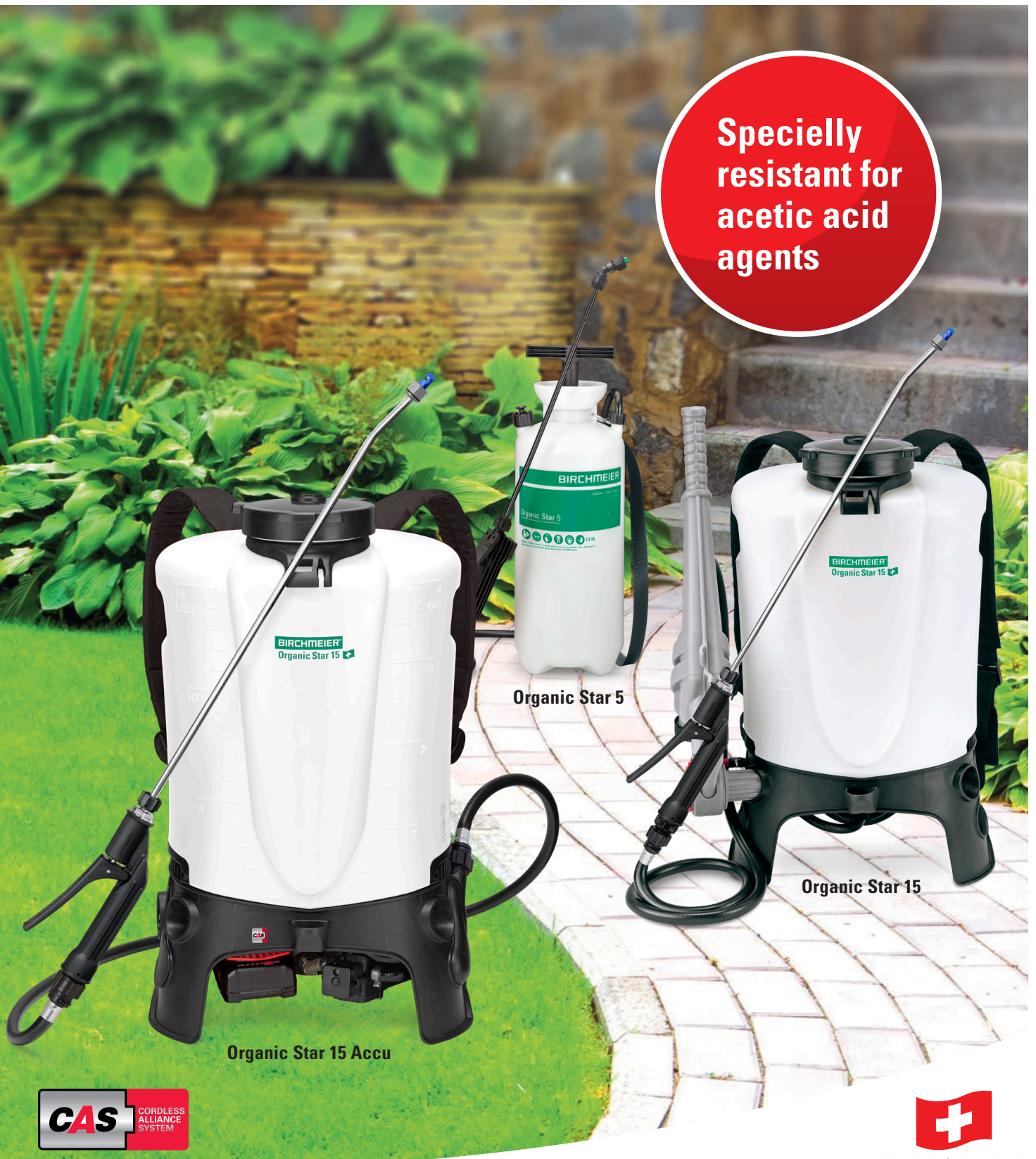
Organic Star 5

Specially resistant for acetic acid agents